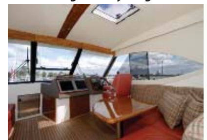
'Big Gun' Flybridge

game fishing they could not believe the condition of the boat, it still looks brand new! A testament to the build quality and general toughness of the product.